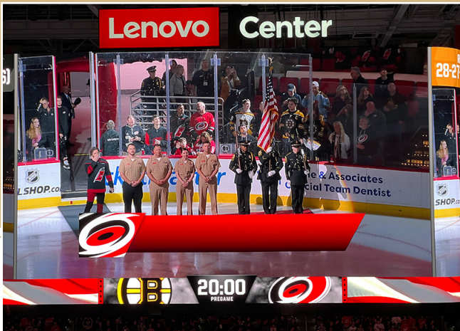
777 Crew on-ice prior to the Hurricanes vs Bruins hockey game.