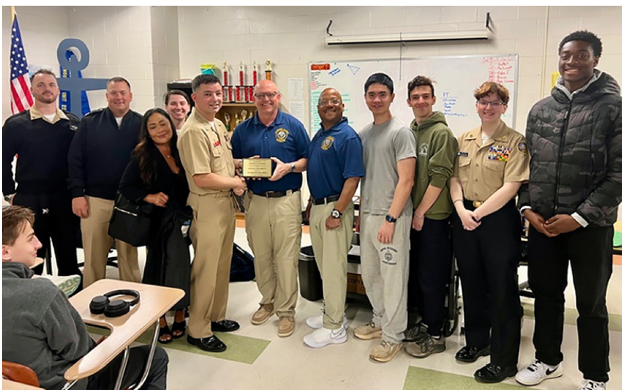
777 Crew led a STEM discussion with the Cary High School JROTC Unit.