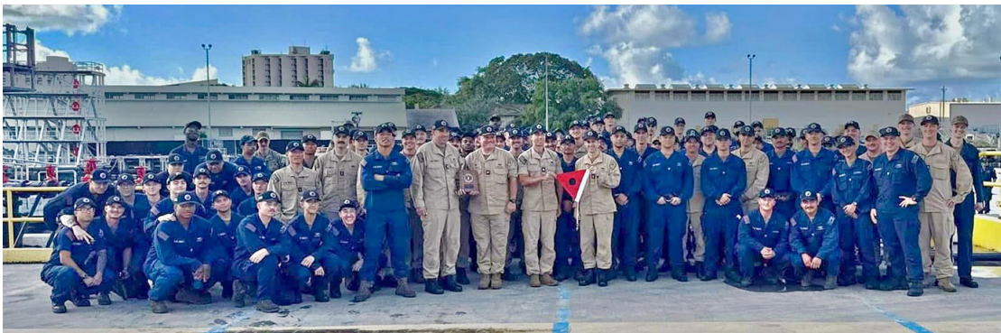
766's well-earned Battle E presented to the submarine, both the boat and the crew, which achieved the highest level of overall readiness.

UNC Charlotte's Men's Basketball Team visited the 766 in December 2024 while on island for the Diamond Head Classic Tournament.