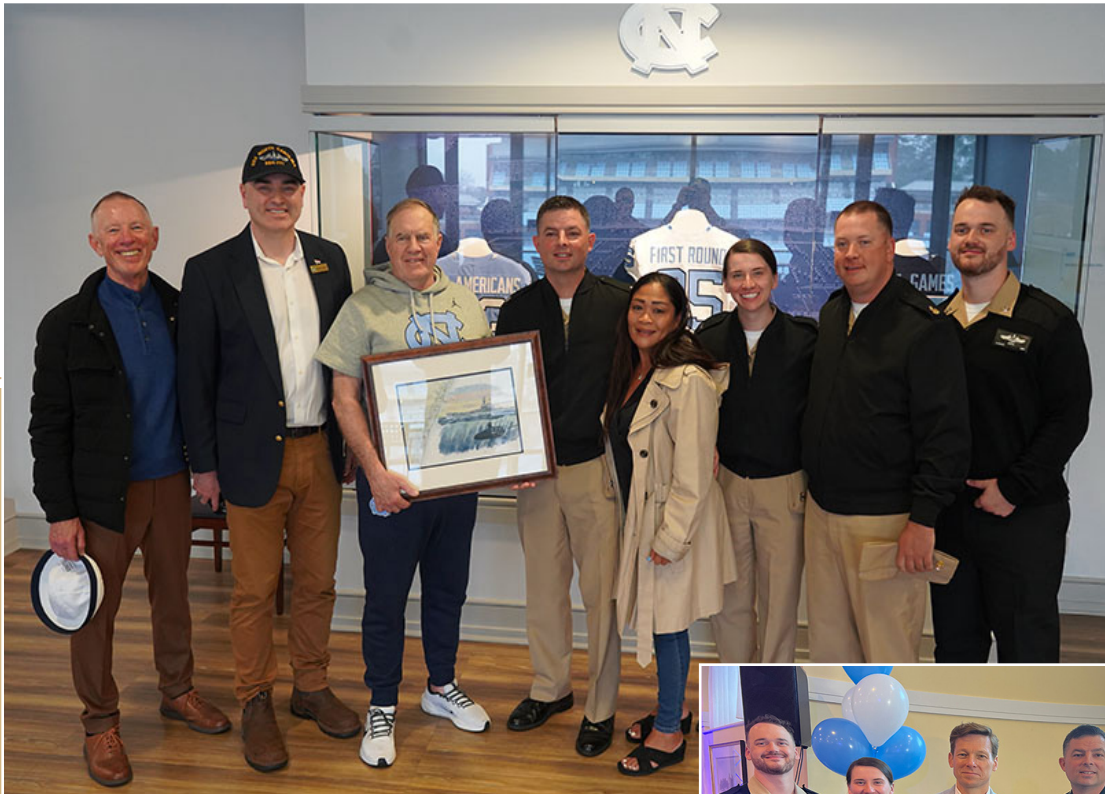
Presenting UNC Football Coach Bill Belichick with a painting depicting the Wilmington coast, with both the Battleship and Submarine NC.